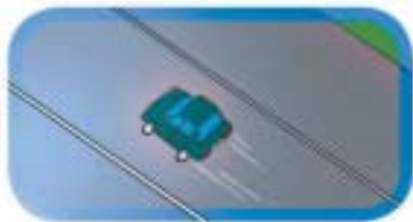
Reserved Narrow-band 868 MHz frequency

Cooper Security was one of the first companies to launch genuine narrow-band 868.6625 MHz radio systems in Europe, and can rightfully claim to be the company with the greatest experience in the field.