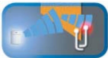
Dual Diversity Technology

The 'dead spot' effect is worst at 1/4 of a wavelength, which is exactly the separation between the two antennae of the Cooper Security receiver. The two antennae (integrated and polarized, vertically and horizontally) are the visible aspect of an exclusive technology developed by Cooper Security, called Dual Diversity Technology. On receipt of a signal the receiver switches instantly between the two antennae and selects the strongest signal for processing, thus setting a new standard in alarm system receiver sensitivity and stability. The presence of two aerials in other products may not indicate the use of a true diversity system; some manufacturers merely connect the two aerials together, which is easier technically, but not effective.