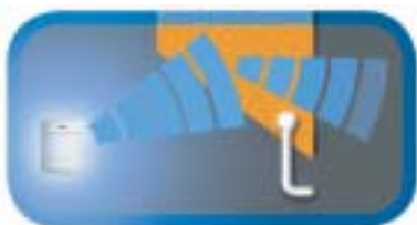
Phase shifted signal not received

Cooper Security developed its receivers after detailed research into the way that radio signals at 868 MHz are propagated inside buildings: when a transmitted signal strikes a solid body, such as a wall, some of it passes through in an attenuated form, and some of it is reflected. However, a reflected signal also undergoes a phase shift with respect to its original carrier. This sounds highly technical but the result is all too common – a 'dead spot'!