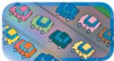
Saturated general 433 MHz frequency

Many manufacturers of alarm systems have tried to develop solutions to cope with the congestion on the 433 MHz band by using systems with two or more frequencies, or complex spread-spectrum products. We, at Cooper Security, believe this is not the best solution, since a car driving along the M25 at 8 a.m. will always take much longer to cover a given distance than one driving the same route at midnight.